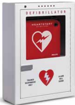
Premium Surface Mounted Cabinet

16.5" (42 cm) w, 15" (38 cm) h, 6" (15 cm) d