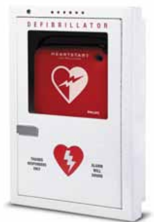
Premium Semi-recessed Cabinet

16" (41 cm) w, 22.5" (57 cm) h, 6" (15 cm) d