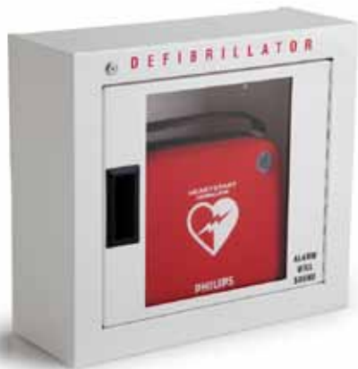
Basic Surface Mounted Cabinet

To help mobilize an emergency medical response or deter AED theft, Philips offers three different battery-operated, alarmed wall cabinets. The basic cabinet has a simple audible alarm. Also available are two premium cabinets: a wall surface mounted cabinet and a semi-recessed cabinet that is inserted into a wall cut-out for a less obtrusive look.* The premium cabinets feature combination audible and flashing light alarms. They are made of sturdy heavy-gauge steel, and are large enough to accommodate additional medical supplies, such as oxygen. You can also connect the premium cabinets' alarms to your internal security system so that a more coordinated emergency response can be mobilized centrally.